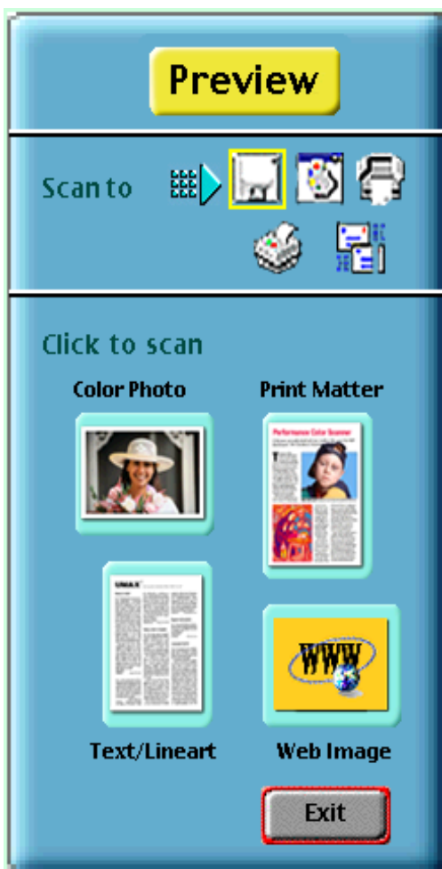
Beginner scanning mode